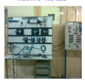
Industrial Fluid Power Lab